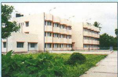
Newly built girls' hostel at Kolkata Campus