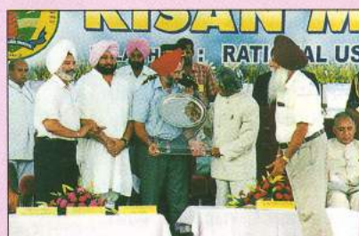
Hon'ble President, Dr A.P.J. Abdul Kalam, at Kisan Mela, PAU, Ludhiana

President Dr Abdul Kalam visited PAU, Ludhiana on 4 September 2003 to witness the Kisan Mela. Commenting on the agricultural scenario in the country, he recalled the days when starvation was prevalent. He lauded the role played by the PAU in promoting technology-based agriculture and in helping the nation achieve food security. He emphasized the need to graduate to a second green revolution that would aim at higher