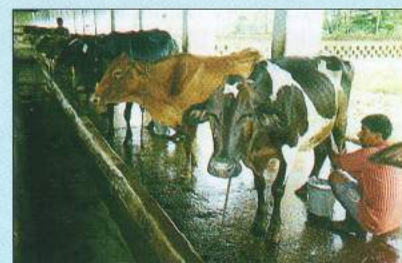
Cattle farm at KVK, Jalpaiguri