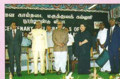
Inaugural function of Centenary Celebrations

The Vice-President of India, Shri Bhairon Singh Shekhawat, inaugurated the Centenary Celebration of the Madras Veterinary College, held on Sunday, 6 July 2003. He declared open the centenary museum, and released souvenir. The Chief Minister of Tamil Nadu, Selvi J. Jayalalithaa, laid the foundation stone for the centenary building, inaugurated the interactive touch-screen terminal on livestock and pet animals, and addressed the gathering.