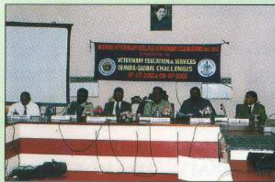
Symposium on "Veterinary Education and Services in India: Global Challenges"

As a part of the Centenary celebration, a symposium on "Veterinary Education and Services in India: Global Challenges" was also organized on 7-8 July 2003. The following recommendations were made during the symposium: