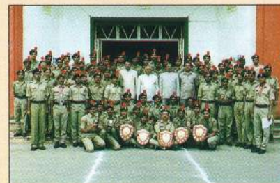
Successful holders of NCC 'C' and 'B' certificates during Annual Training Camp, Nanded

The NCC Cadets of Marathwada Agricultural University, Parbhani, bagged General Championship Trophy 2003-2004 successively for the second time in the Annual Training Camp of 52 Maharashtra Battalion NCC, Nanded held from 1 to 12 August 2003, by winning 4 gold, 4 silver and 3 bronze medals.