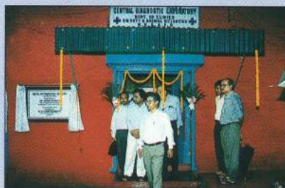
Central Diagnostic Laboratory under Dep. of Clinics, Inaugurated by Shri Anisur Rahman, Hon'ble Minister, Dep. of ARD, Government of W.B.