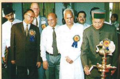
Shri Virbhadr Singh, CM (H.P.), inaugurating the conference

The conference involved in-house deliberations for 3 days and field