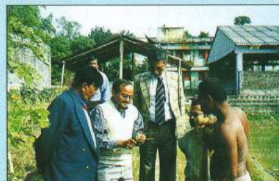
Prawn Hatching Farm of WBIAFS in Midnapore dist.