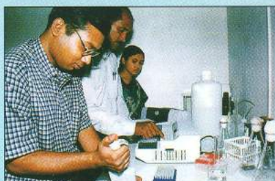
Parasitology laboratory at Kolkata Campus

Faculty of Fishery Sciences, eight departments exist. This faculty offers B.F.Sc. and M.F.Sc. degrees (newly implemented). Doctoral programme is under review.