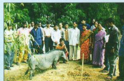
Ghoongroo pig (newly isolated breed) at KVK, Jalpaiguri

The university has established one model piggery farm at Mohanpur Campus along with a biogas plant and also at Ramsai Farm, Jalpaiguri, for demonstration and training of rural people and distribution of animals to poor farmers, and also for conducting research and academic activities. One quail demonstration unit, turkey farm and duck-cum-fish farm have been introduced at the