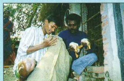
Duck distribution at village level