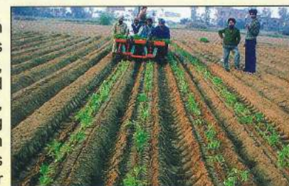
Vegetable transplanter (tomato seedlings)

(Punjab Agricultural University, Ludhiana)