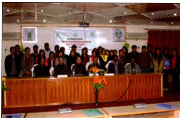
Participants at symposium