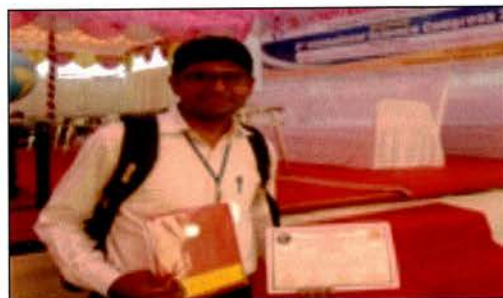
Young Scientist Award