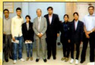
VC with honoured students