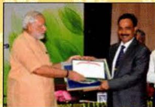
Sh. Narendra Modi conferring Award to Director, NDRI