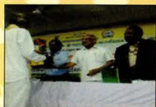
Award to farmers on Farm School on AIR

The Directorate of Extension organized a programme: Farmers' school' (Nabhowani Shetishala) in collaboration with Aakashwani, Nagpur, dealing with Dairy Production. The farmers were awarded for their participation in a series of 13 radio programmes on 13 August 2014.