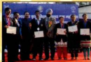
Students of UAS, Raichur received medals at 15th 'AGRIUNIFEST'