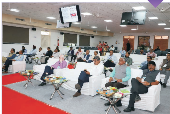
Participants of IX IAUA Regional Meet held at NAU-Navsari