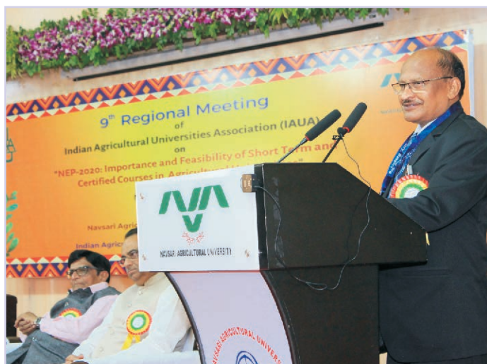
Participants of IX IAUA Regional Meet held at NAU-Navsari