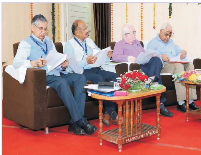
Dignataries on dais