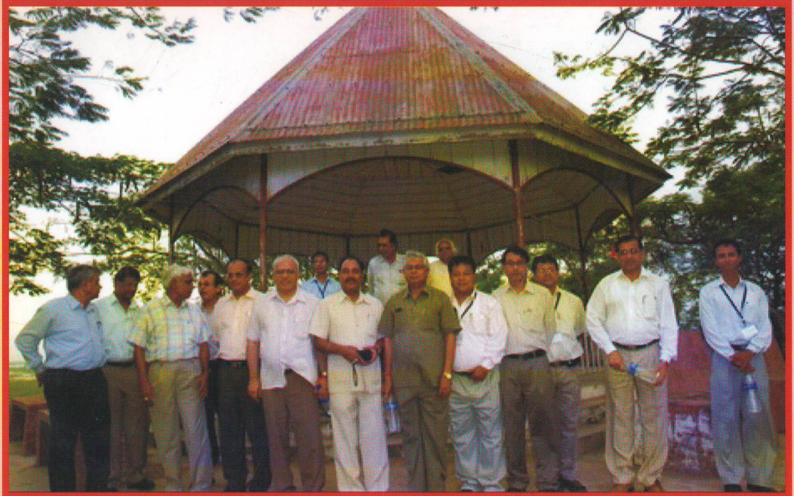
VCs, AUS visiting Loktak lake at Imphal