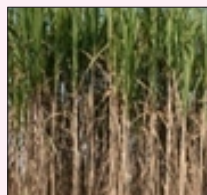
Sugarcane CoPb 94