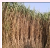
Sugarcane CoPb 93

Portable Maize-Grain Dryer: It has been developed in collaboration with M/s Nu Tech. Dairy Engineers, Ambala. This 3 ton capacity, portable type maize dryer is capable of drying the grain efficiently by reducing the moisture at the rate of 1.1-1.5% per hour, without affecting the germination of maize grains or seeds. This dryer is portable but can also be fixed at one location.