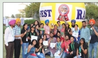
Youth Festival participants of PAU

The PAU won Overall Trophy of 17 th All India-Inter-Agricultural Universities Youth Festival 2016-17, organized by the ICAR, New Delhi at Rajasthan University of Veterinary and Animal Sciences, Bikaner (Rajasthan) during 22 -25 Feb. 2017. The PAU students participated in 17 event pertaining to Literary, Fine Arts, Music and Theatre and won Gold Medal in Debate; Silver Medal in One-Act Play and Elocution; Bronze Medal in Mime, Rangoli, Collage; and 4 th Position in Spot painting and Patriotic Group Song.