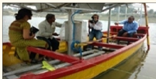
Visit of IFPRI team

Research Institute, visited the university recently in connection with a documentary and appreciated this project.