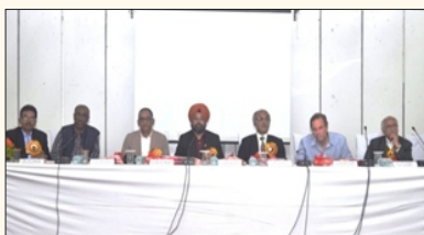
ICARDA and CIMMYT scientists, interacting with the students in conference hall