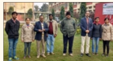
Students selected for higher studies under BRAVE Project, with Principal and staff members