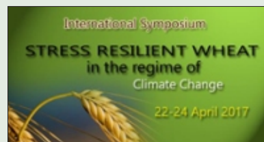
Symposium on Stress-resilient wheat

An International Symposium on 'Stress-resilient wheat in the Regime of climate change' was organized by the university during 22-24 April 2017. In the symposium a galaxy of experts of the relevant field participated and deliberated on the pressing problems.