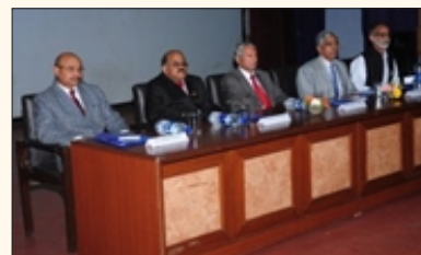
Dr G.S. Khush, with dignitaries

Dr Gurdev Singh Khush, an internationally acclaimed farm scientist, visited CSKHPKV, Palampur during 27-31 Mar. 2017. He visited Department of Crop Improvement. He also delivered a talk on "Biotechnology for food security" and had interaction with the faculty members and students of the constituent colleges of the university.