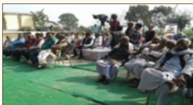
Farmers attending Crop Seminar at KVK, Saraiya

The KVK, Saraiya organized Crop Seminar on 15 Feb. 2017 at its premises Saraiya, Muzaffarpur, in collaboration with DurDarshan, Muzaffarpur and CSISA. The title of the Seminar was 'Ek mulakat krishi vaigyanikon ke sath'. The programme was inaugurated by DEE, DRPCA, Pusa. Total 14 scientists of different KVKs and the university along with 100 farmers participated. During the seminar the farmers' problems were solved on the spot.