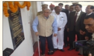
Shri O.P. Kohli, inaugurating