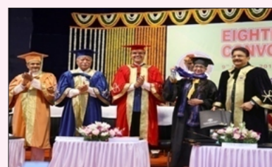
Dignitaries at the Convocation dias