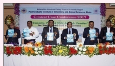
Release of compendium by dignitaries