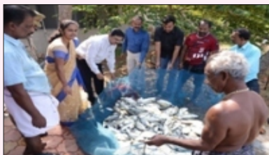
Field Aquaculture and Processing Technologies

Directorate of Extension established under the KUFOS promotes development of fisheries by providing necessary information, imparting training and other extension support continuously to the fisherfolk and fish farmers. Besides, dissemination of innovations in the field of aquaculture and fish-processing technologies, it also helps identify the problems of the farmers and offer solutions at the right time.