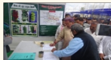
Shri Radha Mohan Singh, inspecting self-reliant banana farming

As banana is a major fruit crop of the state, a project was undertaken by the university from its own resources to develop a self-reliant banana-farming module. The objectives of the project are to standardize the processes for extraction of fibre, pulp and sap from the pseudo-stem, explore the possibilities of using some parts of the plant as a cattle feed, and to exhibit the impact of modern irrigation methods on banana production. This project may show a path to the banana-growers for a self-reliant and self-sustainable banana-farming system, which can help in the developing entrepreneurship in the agriculture sector.