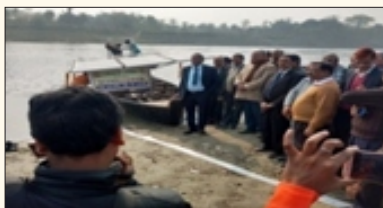
Launching of boat-mounted solar pumping system