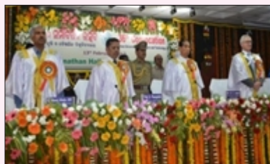
H.E. Dr S. C. Jamir at 36th Convocation