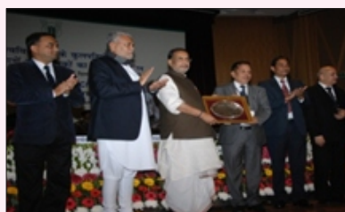
Shri Radha Mohan Singh, presenting award to the Vice-Chancellor