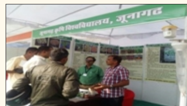
Display stall of JAU at Western Region Agricultural Fair