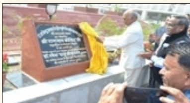
Shri Ram Nath Kovind inaugurating Udyan

Shri Ram Nath Kovind, the Governor of Bihar, inaugurated Saraswati Udyan in the university HQ premises on 3 Mar. 2017. This garden has completely changed the outlook of the campus with its green lawns, lights and fountains.