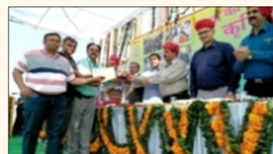
Distribution of certificate