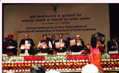
Shri Radha Mohan Singh releasing book