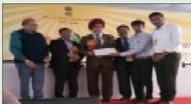
AAU staff receiving Uttam stall puraskar