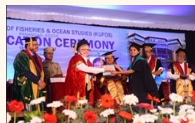
H.E. Shri P. Sathasivam, conferring degrees to students