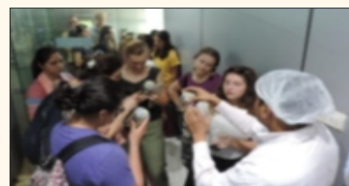
Group of USA students

Tissue-culture laboratory and got inspired deeply by the services rendered by agricultural universities of India, especially of Gujarat, for practical benefit of farmers and contribution towards food security.