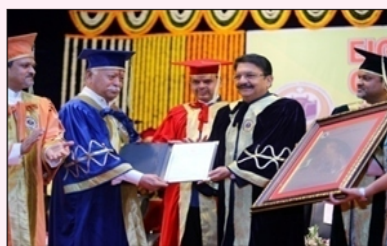
Honourary D.Sc. being conferred to Shri Mohan Bhagwat

MAFSU on Thursday conferred its first honorary doctorate of Science (DSc) degree to Shri Mohan Bhagwat, RSS chief, for his 'outstanding' contribution towards gaushalas, conservation of indigenous cow-breeds and organic farming.