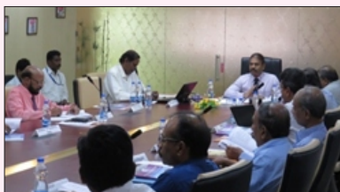
Experts on discussion