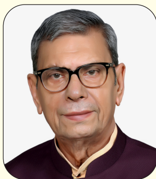
Prof. Ashim Kumar Ghosh Hon'ble Governor of Haryana